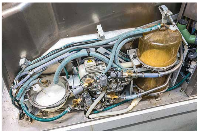
Each GEA robot has a reservoir for the milk destined for the bulk tank and a reservoir for separated milk. This reduces the number of necessary cleanings when cows are undergoing treatment.

The herd is made up of easy- and fast-milking cows. All milking is done by the two robots due to lack of time and any other options. The animals with health issues are milked in an organised way. This type of management allows the farm to carry out just three main cleans, which are recommended by the manufacturer. However, the heater is supplied with cold water so each cleaning uses more electricity. Once a day each box receives a system clean and a local intermediate wash.