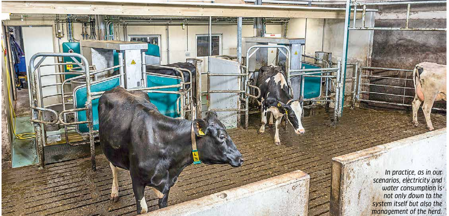
In practice, as in our scenarios, electricity and water consumption is not only down to the system itself but also the management of the herd.