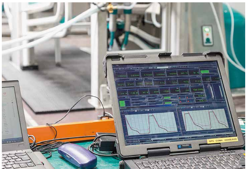
By replicating various milk flow rates, the DLG measures electricity consumption relative to the milking performance of the cows. The difference between one- and two-box electricity use is surprising.

A few words on water and consumables, with the two-box DairyRobot R9500 consuming 6.0g of teat dip and more than 14.0g of peracetic acid. All processes such as dipping are carried out on individual animals so there are no differences. The same applies to rinsing the TOF camera, which detects the teats; this takes 130ml of water after each milking. In all, the DLG measured 2.9 litres of water after each milking, which is split between cleaning the teats, diluted water for the peracetic acid for the intermediate cluster disinfection and removing the teat dip. It is also worth