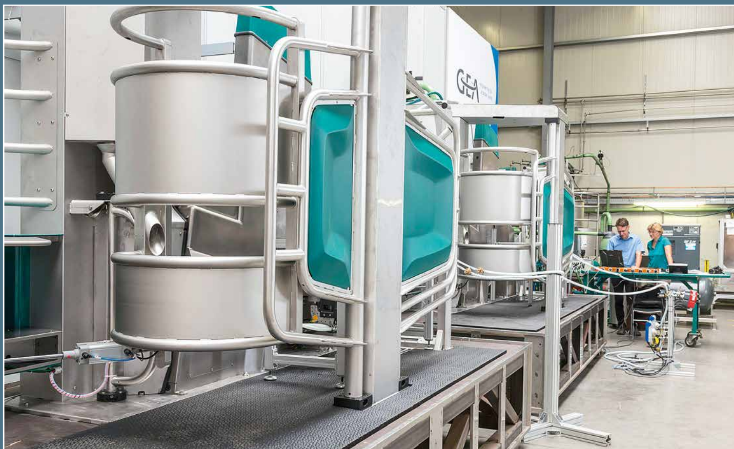
We know from the May issue how much water and electricity a single GEA Monobox milking robot uses. But what happens to the measurements when you add a second box? It's not necessarily as straightforward as simply 'doubling the consumption and costs'. Photos/graphs: Stefan Tovornik.

So far we've completed tests on the Lely A4 and GEA Monobox as stand-alone robots. But what happens when you add a second unit? Here we double up ... to see how two GEA robots perform