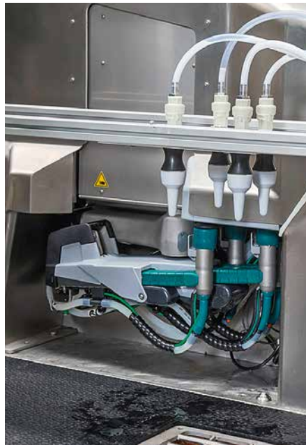
Teat cleaning and dipping operations take place inside the teat cups on the GEA DairyRobot.

The best part here is that 20 litres of water are collected inside the cleaning tank of the supply unit at the end of the last rinse. This water is reused for a post-rinsing cycle and in the next main clean. This 20 litres may not seem a lot, but in a double-box system it takes just 67 litres for a main clean on each robot. Compare this with the main clean on the Monobox, which used 82 litres of water in the DLG test.